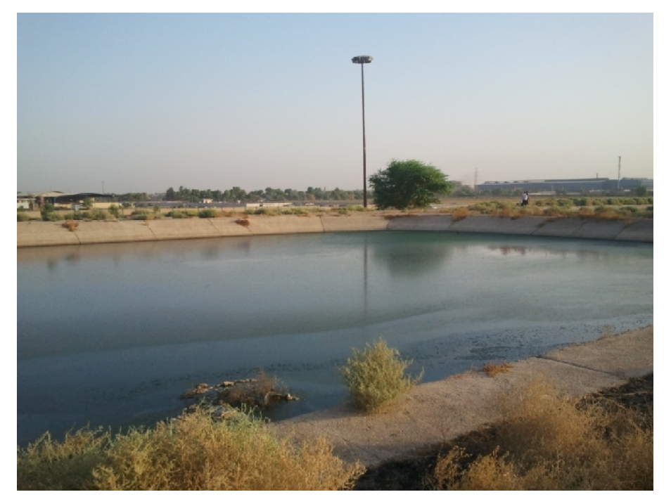
Fig. 1. A view of stabilization ponds of Ahvaz's slaughterhouse.